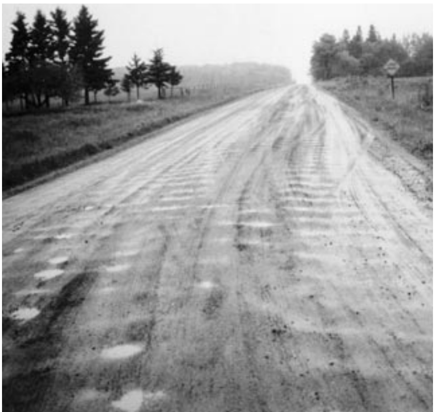
▶ Severe washboarding traps water.