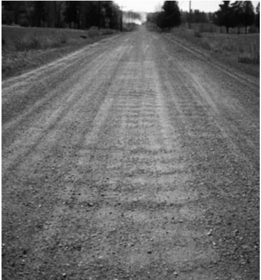
▼ Moderate washboarding in center of road.

Operating a motor patrol grader at a high rate of speed can actually create corrugations during routine maintenance. Speeds below 10 mph are recommended. Proper blade angle and pitch, and proper tire inflation, are also essential.