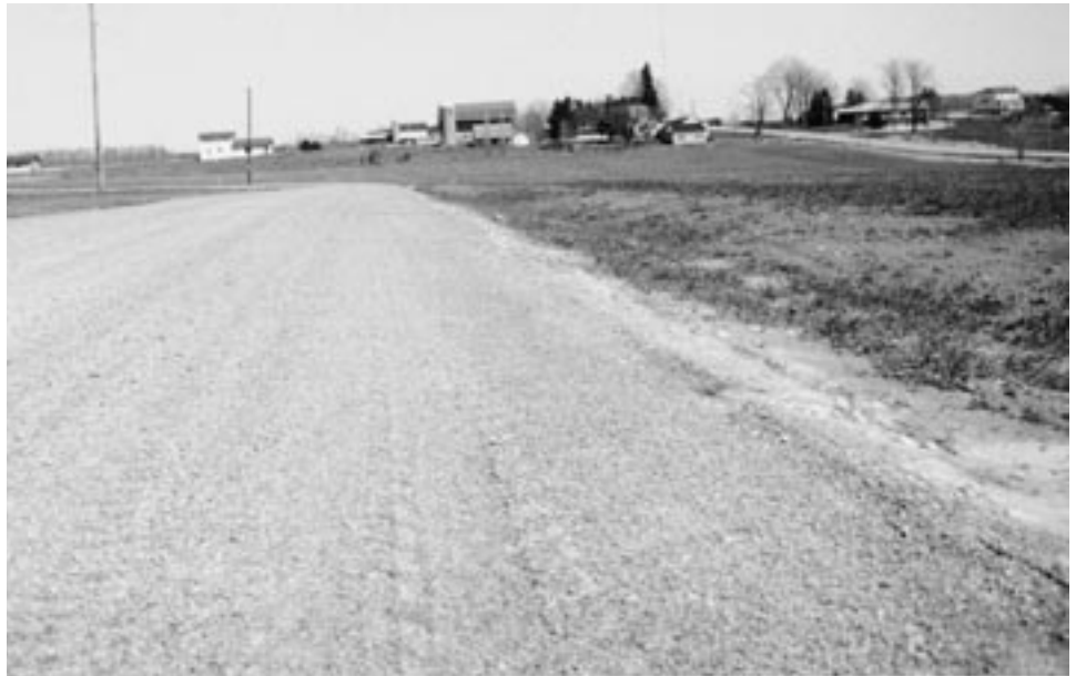
Flat crown with poor grading has created secondary ditch preventing free drainage into roadside ditch. ▼