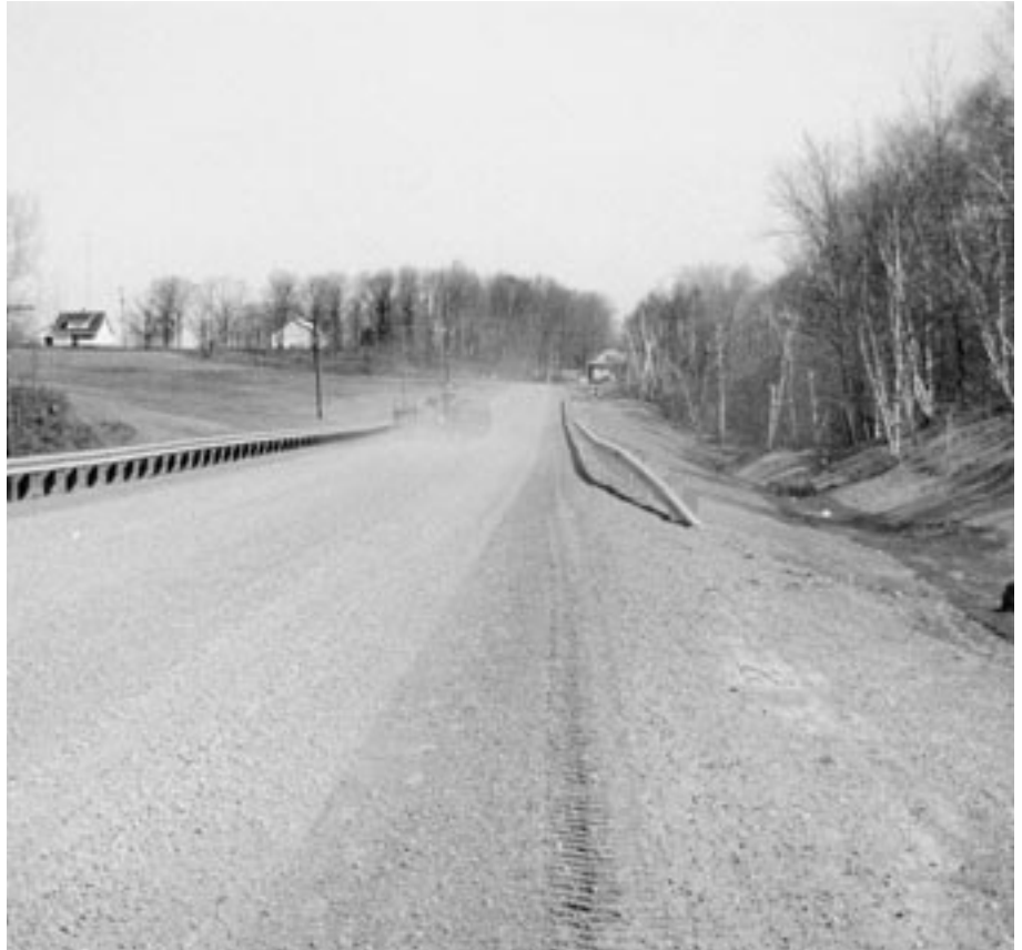
► Newly constructed road with excellent crown, drainage and gravel layer.

New construction with excellent crown, drainage and gravel layer. Little or no distress.