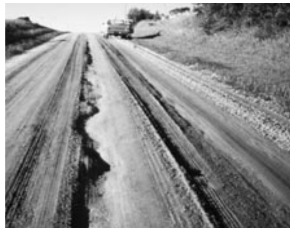
▲ Poorly graded crown traps water causing it to run down center of road.