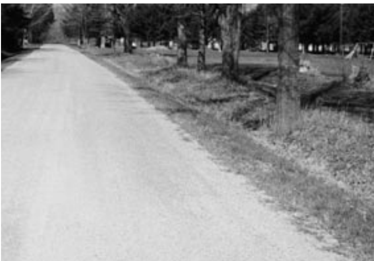
▲ Good ditches.