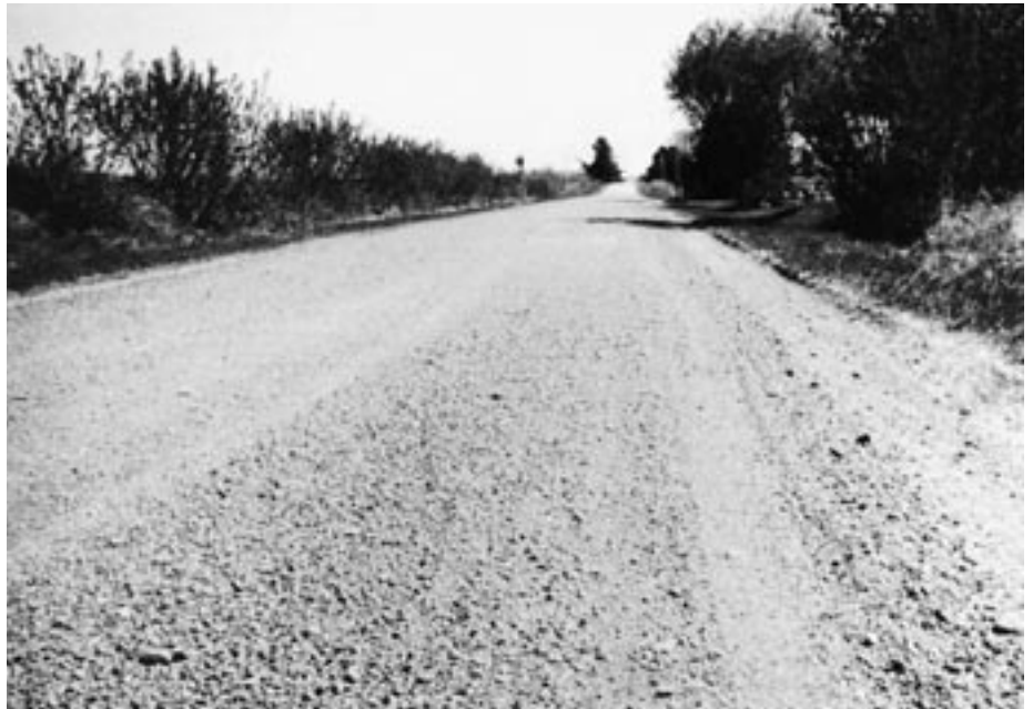
▲ Loose aggregate over most of road. Light grading and compaction during wet weather would improve stability and develop a surface crust.

Loose aggregate may be temporarily bladed to the shoulder although you have to be careful not to restrict drainage. By remixing loose aggregate with fines from the road edge it may be possible to produce a well graded mix. However, a severe accumulation of loose aggregate usually requires mixing with additional well graded surface gravel.