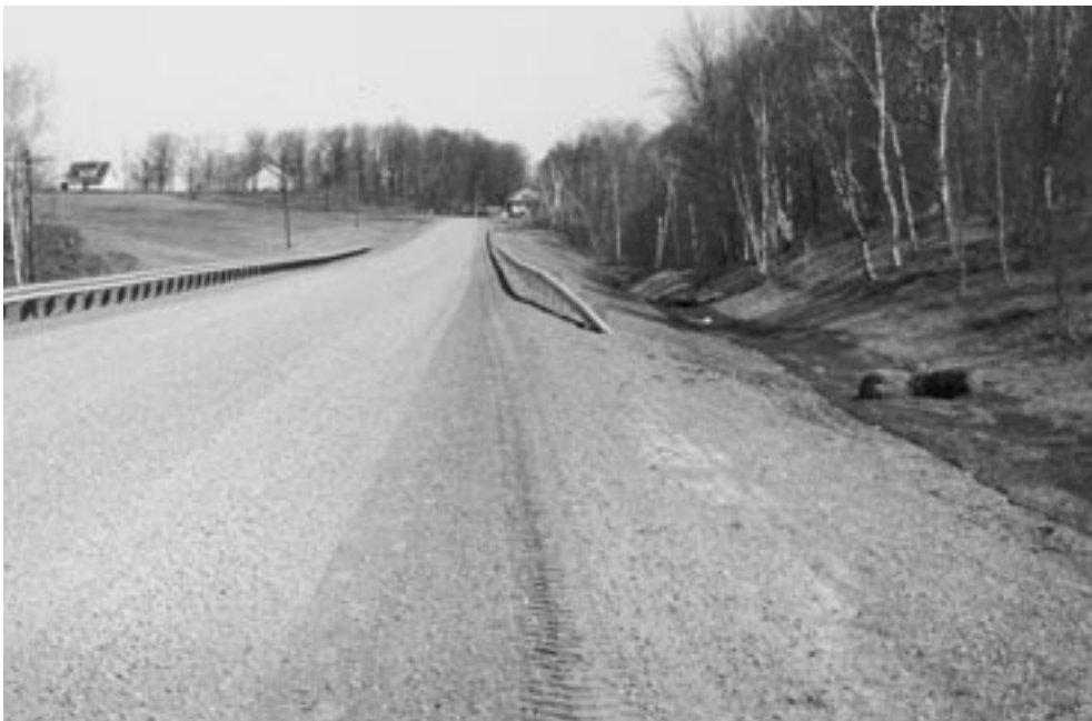
◀ Excellent drainage with wide deep ditches.

Roadway culverts tend to fill with debris and silt. They must be cleaned routinely to maintain their water carrying capacity. Replacing headwalls and riprap is also necessary to prevent erosion. Collapsed or damaged culverts must be replaced.