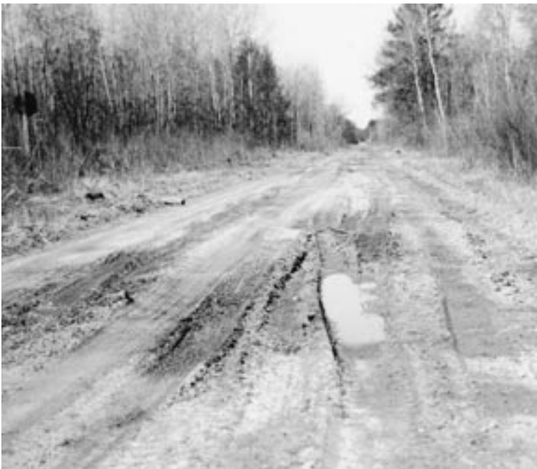
▲ Deep ruts and potholes. No drainage. Travel is difficult.