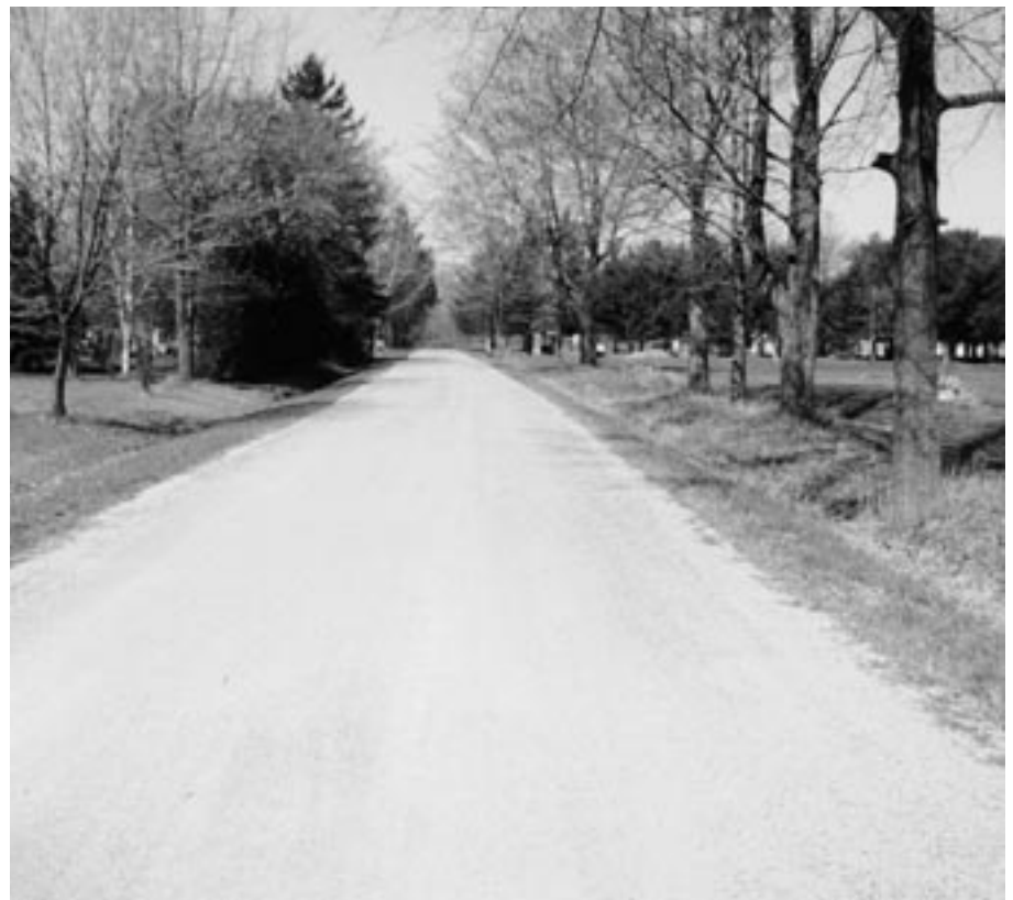
► Road has excellent crown. Gravel has been stabilized for dust control. Very good drainage.