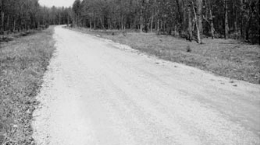
◀ Adequate gravel layer. No ruts or potholes.

The gravel must be of good quality to provide long term service. The gradation and durability of the gravel (measured by hardness and soundness testing) are important. A proper gradation contains a mixture of larger aggregate (1"), sand-sized aggregate, and fines. More fines (8%–15%) are recommended for surfacing gravel than are normally used in base gravel. See Transportation Information Bulletin No. 5, Gravel Roads , for more information.