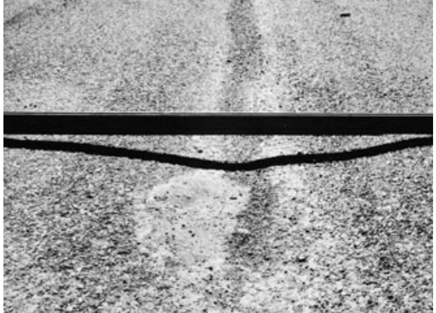
▲ Rut in wheel path needs regrading to eliminate ponding and prevent further road deterioration.

Slight rutting can be removed by blading and restoring the crown. Severe rutting caused by unstable subsurface soils will require improvements in drainage and addition of aggregate.