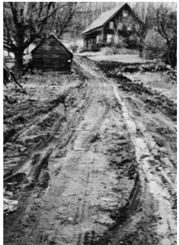
▲ Complete failure. Restricted travel.