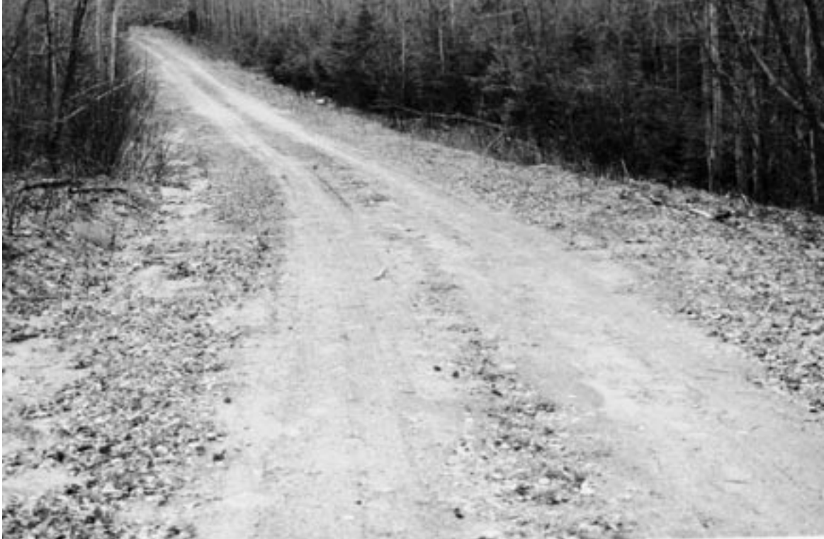
◀ Little or no gravel layer.